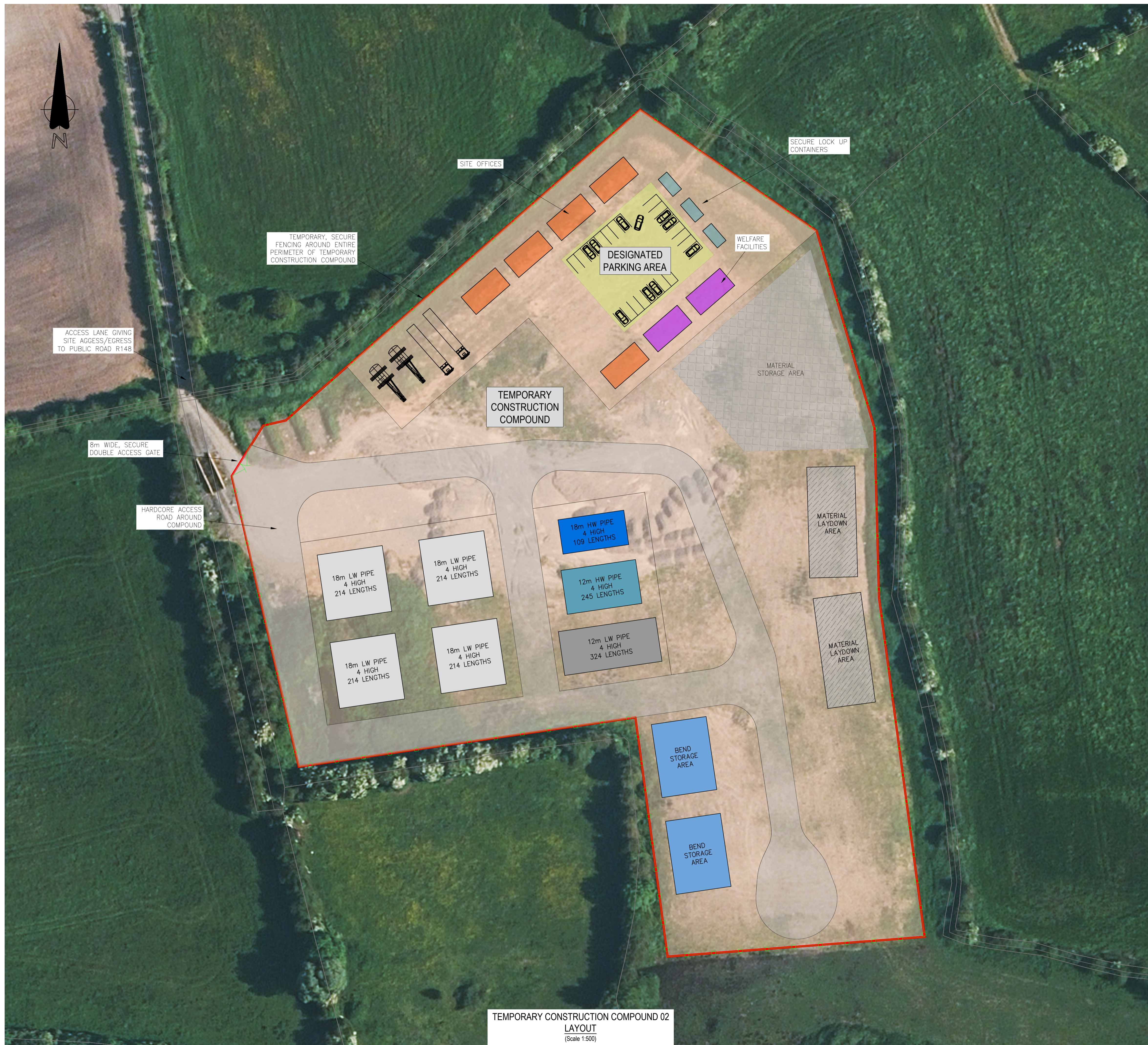
TEMPORARY CONSTRUCTION COMPOUND 02 LAYOUT (Scale 1:500)