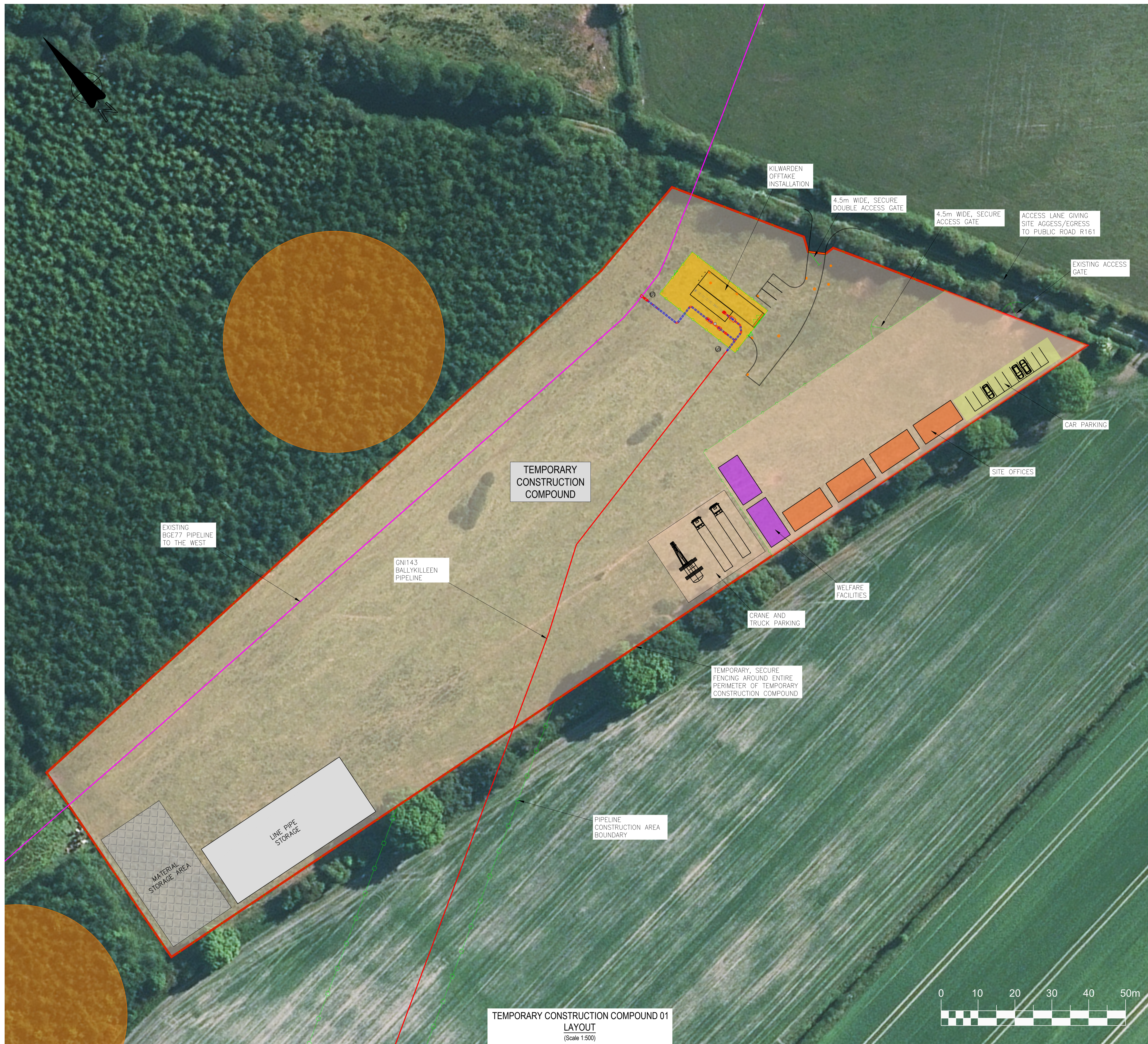
TEMPORARY CONSTRUCTION COMPOUND 01 LAYOUT (Scale 1:500)