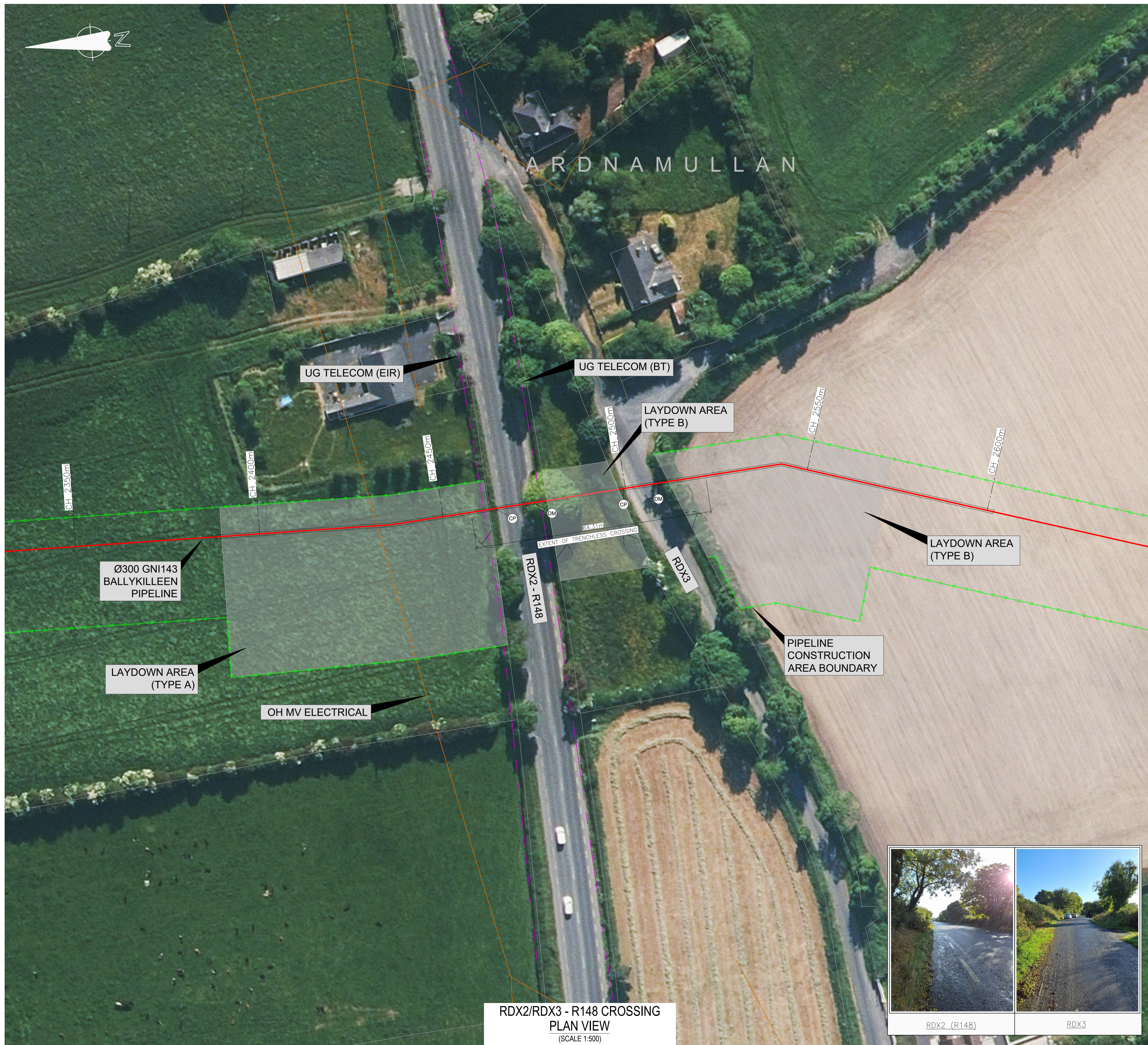
RDX2/RDX3 - R148 CROSSING PLAN VIEW (SCALE 1:500)