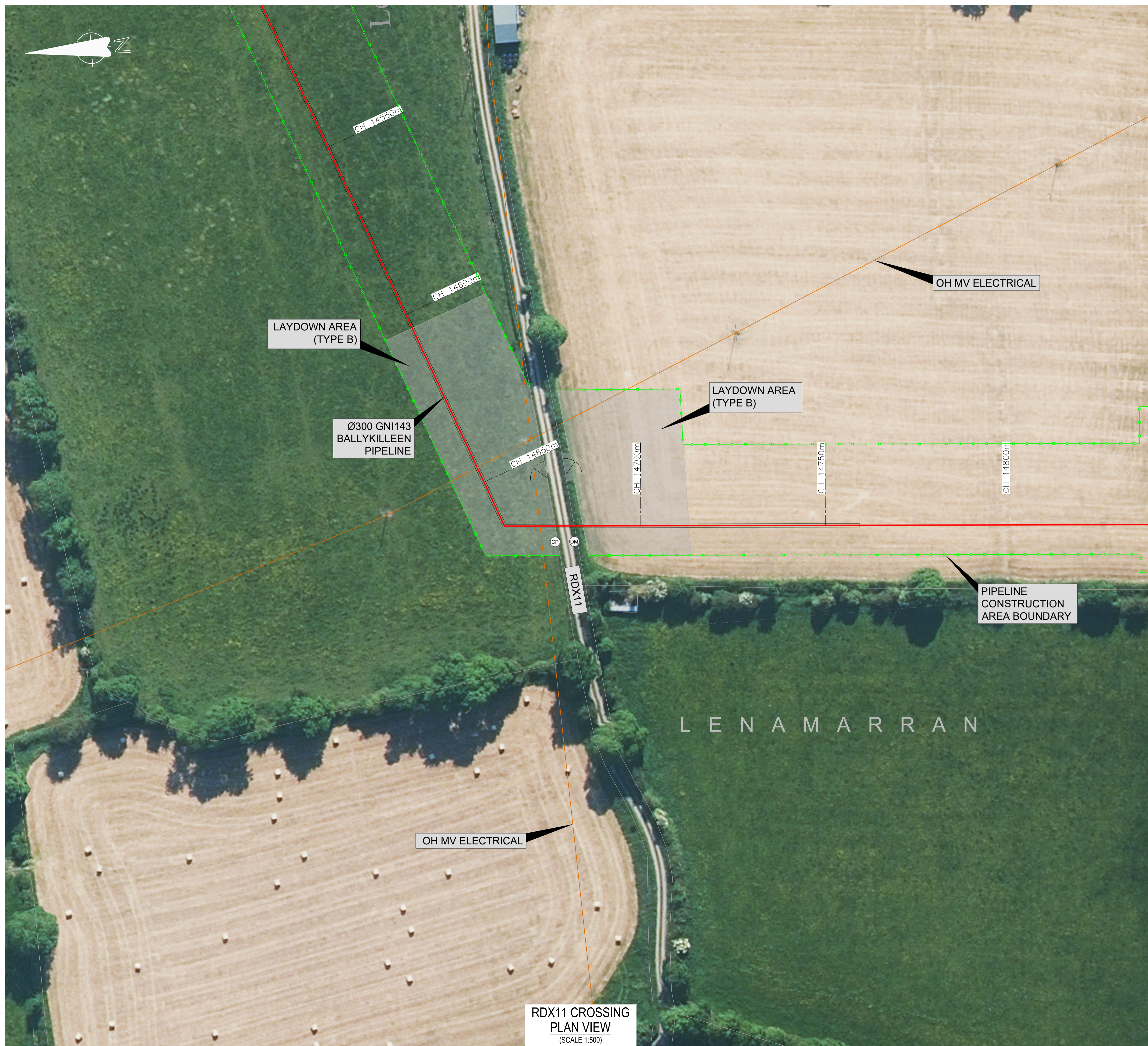
RDX11 CROSSING PLAN VIEW (SCALE 1:500)