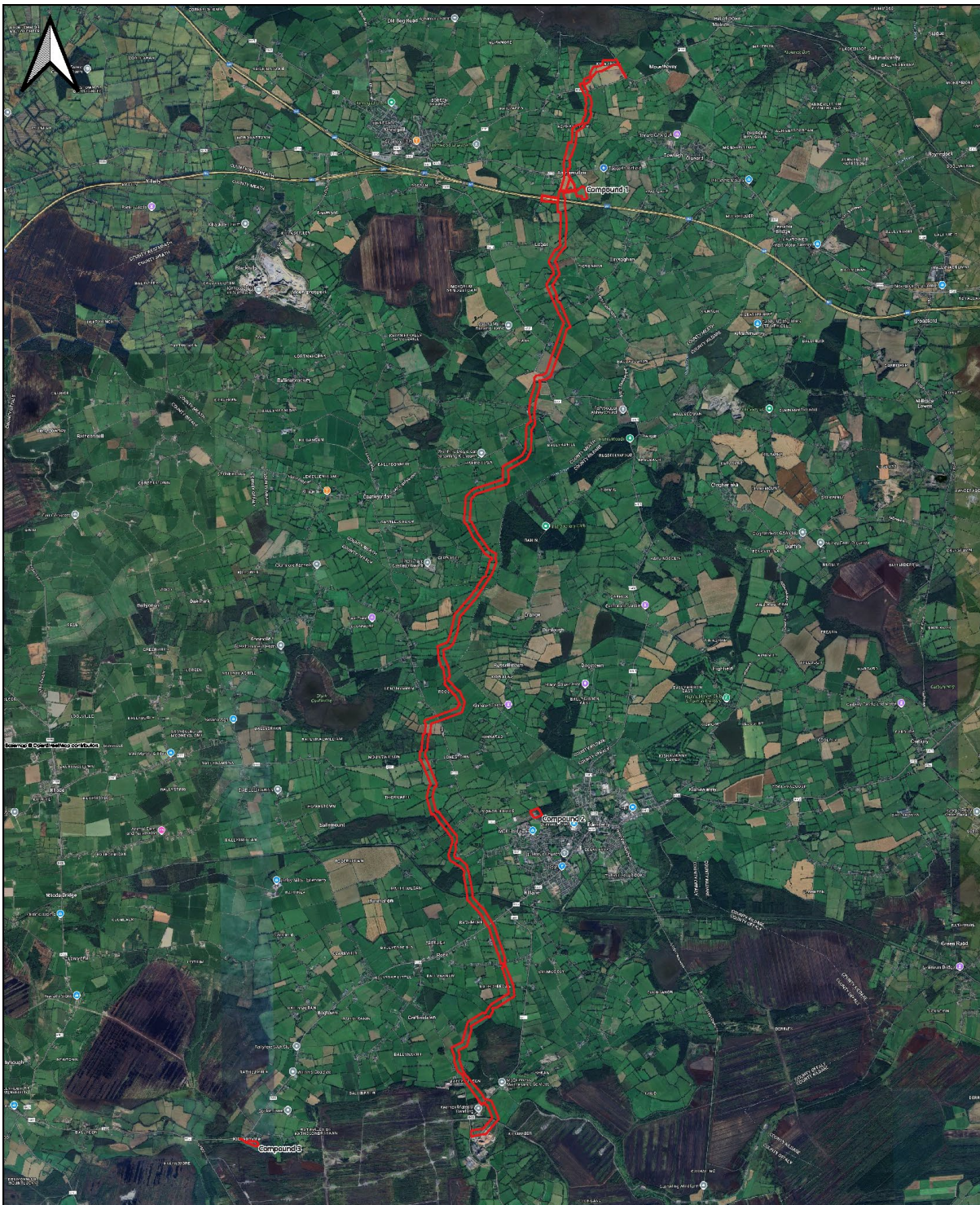
Figure 4.1 Proposed Development - Gas to Bord na Mona, Edenderry Pipeline, AGI and Tie-In Point. (site boundary indicated by redline).